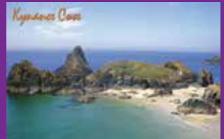
Summer holiday at Kynance Cove

The OMEGA host group in Oxford writes: 'We would like to thank you for your valued contribution to MEA Question Time. Many people said they enjoyed the event and found it very interesting. It was lovely to see you; thank you for giving up your time and energy to give us the benefit of your knowledge and experience, which was much appreciated. Thank you also to those people who assisted you, both beforehand and on the day, or who gave up their time in other ways.'