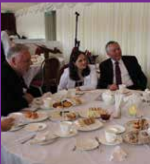
Terry Waite enjoys tea

“Everyone at the Trust works pro bono. Along with our guests, we have some of our Advice Line Team here. All of them are either parents of young people with ME, or people who've had to cope with ME themselves. That's because it's so important, when people call us, that they have confidence in