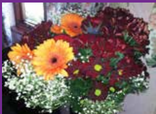
Flowers to thank us

It's that time of year again. I am happy to be setting out another encouraging Tymes Tidings! Here are some of the many people who've been involved with the Trust this year.