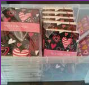
Young Hearts Day gifts

We lit a real candle and posted the photo: on Twitter @JaneCColby, @tymestrust and on our Facebook page facebook.com/tymestrust This is an open page that anyone may view.